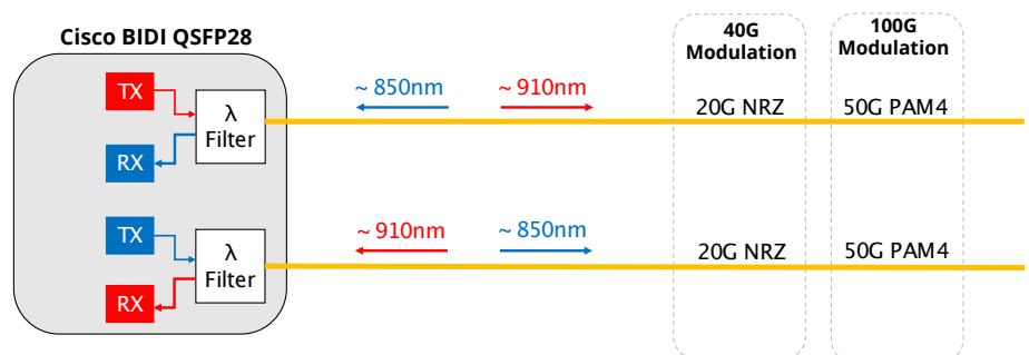
Cisco BIDI Concept

The Cisco 40G&100G BIDI concept is a smart way of using existing optical multimode infrastructure that was originally planned only for 10 Gbit links. This BIDI TAP can also be used for 40 Gbit or even 100 Gbit connections. By making use of the two separate wavelengths on a single fiber and advanced optical modulation methods the upgrade to 40G or 100G becomes straight-forward.