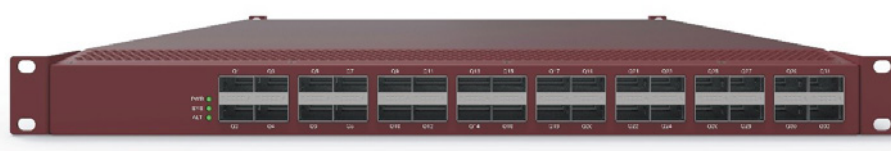
Figure 3 Advanced Network Packet Broker

The NPB reduces wasted resources by eliminating irrelevant traffic and offloading various functions from network tools so they can handle the function they were designed for. The Network Packet Broker can be utilized to add an extra level of fault tolerance and even network automation to your environment; increasing responsiveness, reducing down time, and freeing up personnel to focus on other tasks. The increased efficiency brought about by the NPB increases network visibility, reduces CapEx and OpEx, and strengthens your organization's security posture.